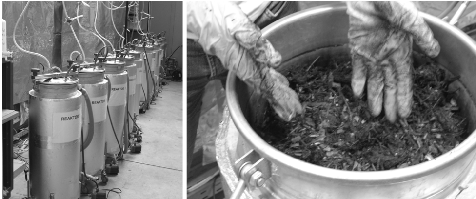
Figure 1 Solid-phase digestion laboratory with ten reactors

anaerobic heat requirement by using the temperature increase resulting from the composting step. The plant had been built mainly for the digestion of green cut and was operated for around two years.