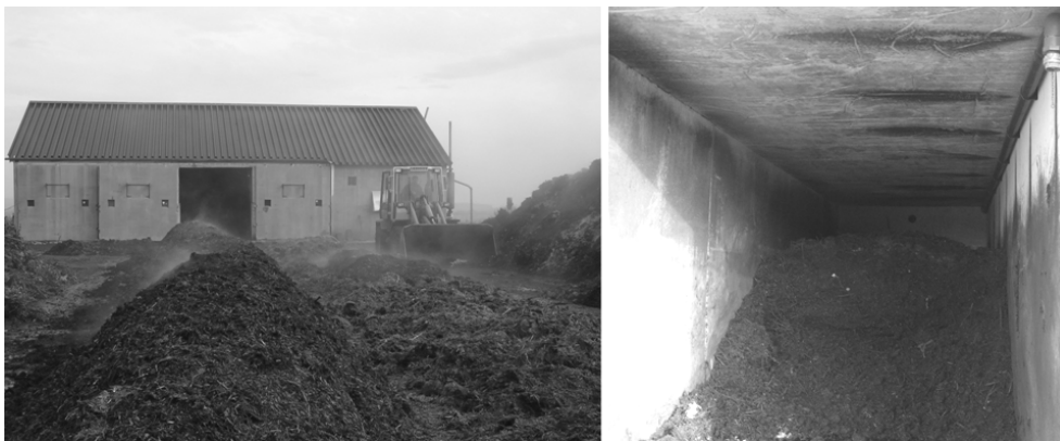
Figure 2 Full-scale farm plant with four solid-phase digestion boxes